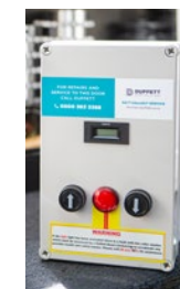
Mostly seen on automatic doors and access control doors

Give us a call and we can organise one of our technicians to undertake a site audit to determine the most appropriate 'Touchless' solution for your operation.