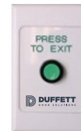
Most people will be used to seeing these types of 'Press to Exit' devices

With Duffett's 'Touchless Access Solution' you can upgrade your entry and exit points to be contactless, operating on hand proximity. By placing your hand near the 'Touchless' sensor, the door will open and close to your requirements.